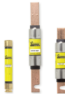
Current Limiting LOW-PEAK Dual-Element Class RK1

Eaton offers a robust line of current limiting fuses, both fusible and non-fusible current limiting circuit breakers, and add-on current limiting modules. Current limiting fuses are available from 1/10 through 6000A at 250V and 600V, with interrupting ratings up to 300 kA. Industrial breakers are available in current limiting versions with interrupting ratings up to 200 kA at 480V without fuses in the same physical size as standard and high interrupting rating circuit breakers. Eaton also manufactures 600 Vac fused and non-fused current limiting circuit breakers with interrupting ratings up to 200 kA.