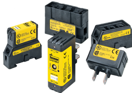
Current Limiting CUBEFuse, Class CF

Current limiting devices are used in a variety of applications—for increasing short-circuit current ratings of industrial control panels, for obtaining higher short-circuit current ratings on individual components, and for use as a line-side device in a series-rated system.