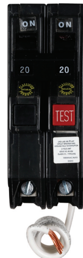
GFCI Circuit Breaker

Eaton's GFCI product offering includes residential circuit breakers with a 10 kA interrupting rating from 15A to 60A. Commercial and industrial offerings include circuit breakers up to a 22 kA interrupting rating from 15A to 50A.